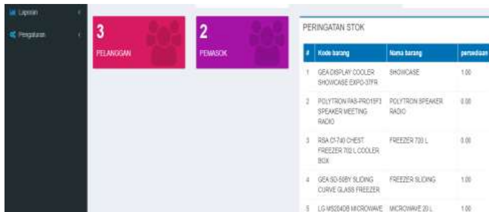
Figure 13. Stock Alert Menu Prototype

After the system designer added a stock alert menu to the dashboard, the MSMEs agreed with the results of the prototype design that had been carried out by the researchers so the next step was to code the system by the system designer. The coding stage is the implementation stage of the software to be created. This implementation process is carried out in accordance with the prototype that has been previously evaluated.