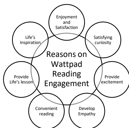
Figure 1: Reasons triggered the participants to engage in reading Wattpad

The illustration demonstrates the reasons of the participants in engaging themselves to read wattpad stories. Based on the data gathered, there are the six emergent themes identified in this study. The most common reasons for reading Wattpad were enjoyment and satisfaction, followed by life's inspiration, satisfying curiosity, provides excitement. Additionally, reading Wattpad had helped them also develop empathy and provided them with convenience reading and life lesson.